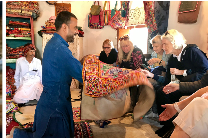
Learning the lexicon of embroidery stitches