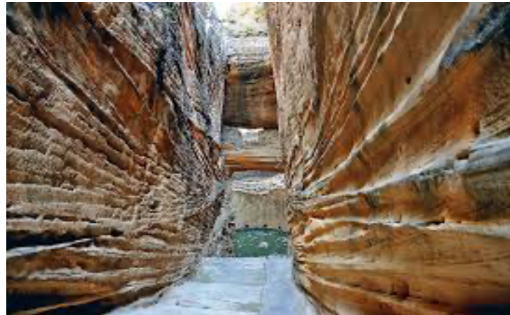
Madha Vav.