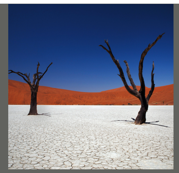
Day 1: Saturday November 9 Windhoek

Arrive in Windhoek where you will be met at the airport by your guide and escorted to your boutique accommodation for the evening.