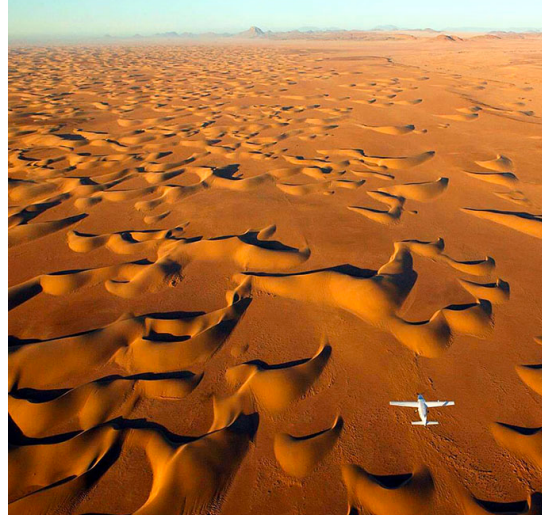
Day 7: Friday Nov 15 Etosha National Park

A full day Game Safari in 4x4 vehicle going into the Etosha Game reserve with a packed Lunch.