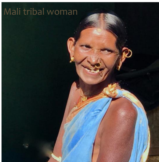
Mali tribal woman