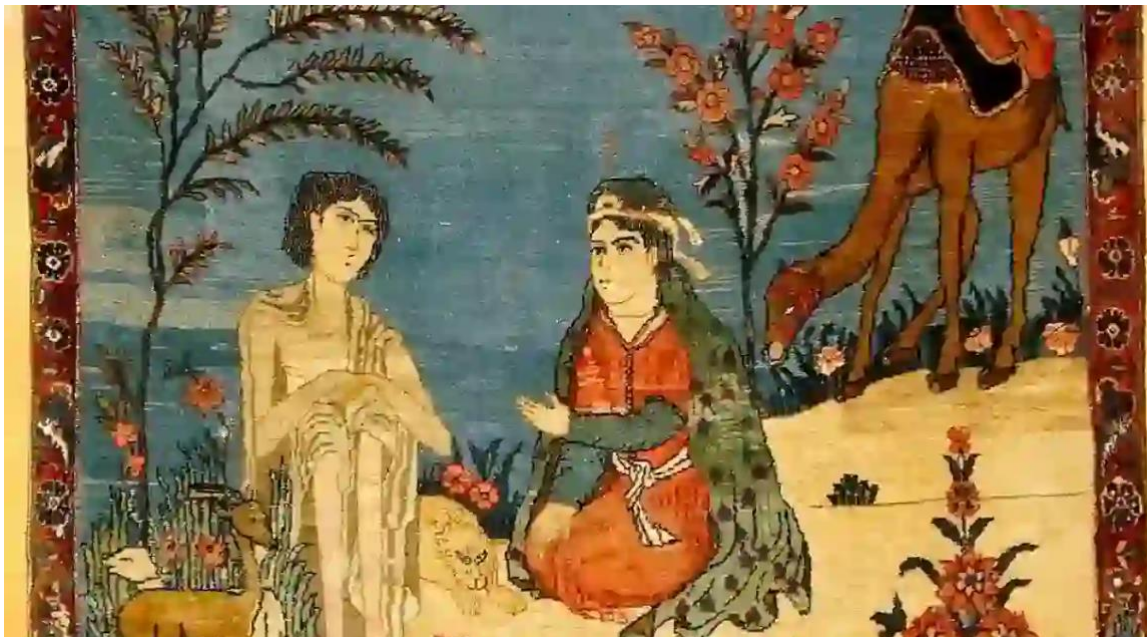
Art on a carpet depicting Leyla and Majnun