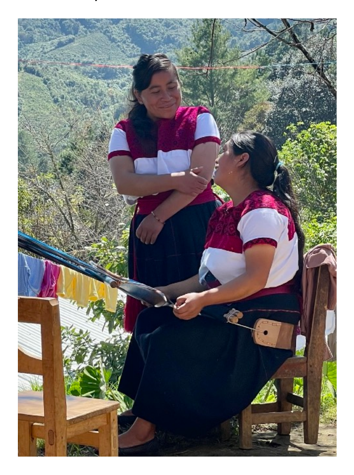
I hear only 5* hotels are good enough for travel in Chiapas. Correct?

Incorrect. One of the best ways to experience Chiapas is to stay in atmospheric small hotels for architecture, cultural relevance, comfort, safety, and personal service. In all cases, we select the best available. All hotels are clean, comfortable, and have private bathrooms and western-style toilets. But please be aware that accommodations may be different to what you are used to in developed countries.