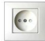
TYPE C EUROPEAN CEE 7/16 EUROPLUG WALL OUTLET