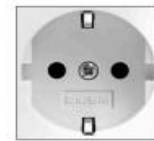
TYPE F GERMAN STYLE CEE 7/4 SCHUKO WALL OUTLET